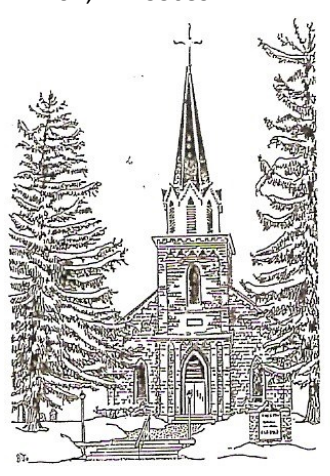
Historic Vasa Lutheran Church Built in 1869 (Vasa Drawing by B-J Norman)