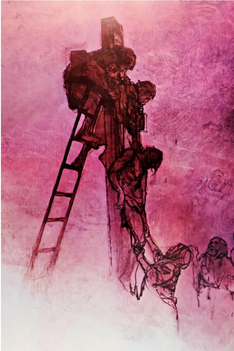
Artwork from He Was One of Us by Rien Poortvliet